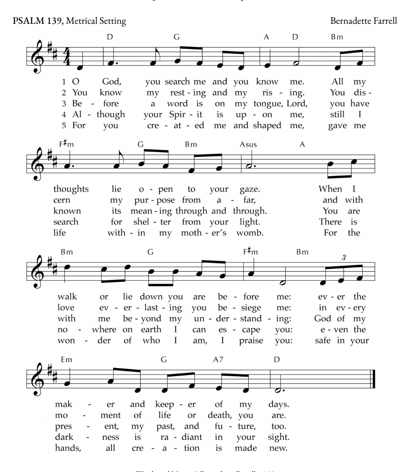
Words and Music © Bernadette Farrell, 1992